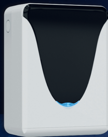
DLF150 LINEAR SMOKE DETECTOR

They are also an excellent choice for buildings where the installation of point fire detectors is not permitted, such as historical buildings with decorative ceilings or premises where the ceiling height is over 12 m.