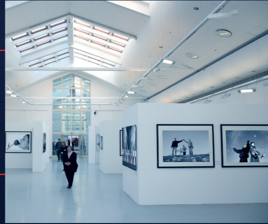
LISTED BUILDINGS (E.G. MUSEUMS AND CHURCHES)